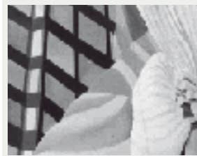
Scenes of Rosslyn